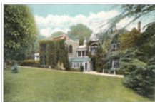
Farrington - Lord Tennyson's residence on the Isle of Wight

Queen Victoria was an ardent admirer of Tennyson's work, and in 1884 created him Baron Tennyson , of Aldworth in the County of Sussex and of Freshwater in the Isle of Wight. Tennyson