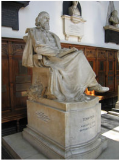
Statue of Lord Tennyson in the chapel of Trinity College, Cambridge.

influence of Keats and other Romantic poets published before and during his childhood is evident from the richness of his imagery and descriptive writing. For example, compare Now sleeps the crimson petal, now the white